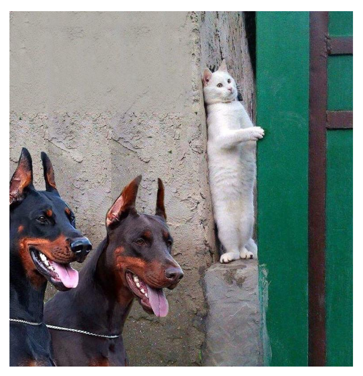
STEALTH AND CUNNING CAN ENABLE THE PHYSICALLY WEAKER TO OUTWIT AND EVADE THE STRONGER! THIS IS ONE OF THE OBJECTIVES OF TRAINING IN "TRADECRAFT".

foreigners engaged in any form of intelligence work, you had damn well better be effective in clandestinity! You need to know skills that just aren't taught in local colleges, university programs, and vocational schools! The nerve-wracking work of the secret servant cannot be done by persons whose wits have