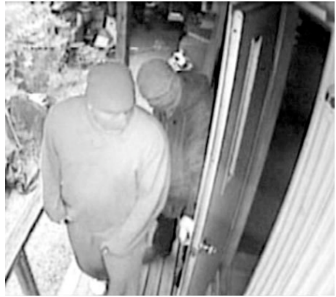
A SURVEILLANCE CAMERA REVEALS TWO VERY UNWELCOME VISITORS. AND MAKE NO MISTAKE ABOUT IT; THE ONLY WAY TO "GREET" THIS KIND OF SCUM IS WITH LETHAL FORCE!