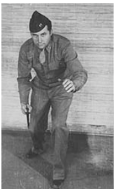
HOW TO ATTACK WITH THE FIGHTING KNIFE. REX APPLEGATE DEMONSTRATES THE IDEAL POSE FOR ATTACKING AN ENEMY WITH THE F&S COMMANDO KNIFE. THE IDENTICAL TECHNIQUES THAT ARE USED WITH THE F&S ARE EMPLOYED WITH THE AF.

Although simple and requiring only a few hours practice for the acquisition of skill, it needs to be emphasized that learning the right fighting methods with which a combat knife is used, and —— ideally —— working to keep them fresh and ready, should be regarded as mandatory for all members of the armed forces as well as for private citizens who keep such a knife at home for defense. Merely having the knife is only part of what gives its user a serious advantage in a life-threatening situation. Expertise is required.