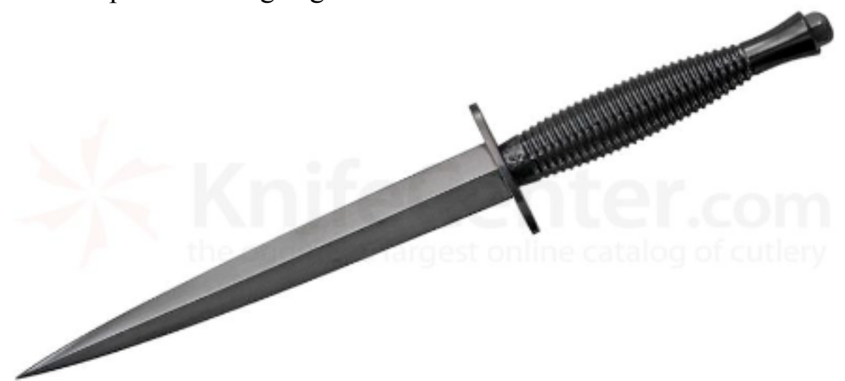
THE LEGENDARY FAIRBAIRN-SYKES DOUBLED-EDGED COMMANDO KNIFE. THIS IS AN EXAMPLE OF THE LAST SHEFFIELD-produced F&S. Designed by the "Father of Western Combatives and Modern Combat Handgun Technique", this excellent knife is ideal for the fighting man (or homeowner) who wants a thoroughly reliable, deadly weapon in addition to his firearm (or, in places where firearms are all but impossible for the decent citizen to obtain, in place of a powerful handgun). Make no mistake about it —— and do not feel that any apologies are required because of it —— this knife is intended for killing at close quarters. In this feral world sometimes the only option is to kill —— or to be killed!

For every serviceman going in harm's way we would <u>urge</u> the procurement of a good fighting knife. And while Randall and Ek knives are superb and definitely of finer manufacture, and considerably more rugged, if the goal and objective is simply killing an enemy efficiently , then the F&S is as good as ever. We like to think of it as "cheap life insurance". After a few hours of practice a good fighting man with an F&S can stand against just about anything his enemy may have —— except a powerful firearm. Few soldiers and marines, let's face it, can afford a Randall or an Ek ; but an F&S is affordable to any enlisted private or corporal who appreciates the need for such a companion when going into a war zone.