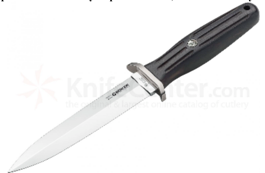
THE APPLEGATE-FAIRBAIRN FIGHTING KNIFE. BUILT ACCORDING TO THAT WHICH ACTUAL HAND-TO-HAND COMBAT EXPERIENCES OF FIGHTING MEN REPORTED FOLLOWING USE OF THE FAIRBAIRN-SYKES COMMANDO KNIFE.

The AF is the only fighting knife that was designed specifically in accordance with straight-from-the-horse's mouth combat experience, as opposed to mere theory or personal taste, or cosmetic fancy.