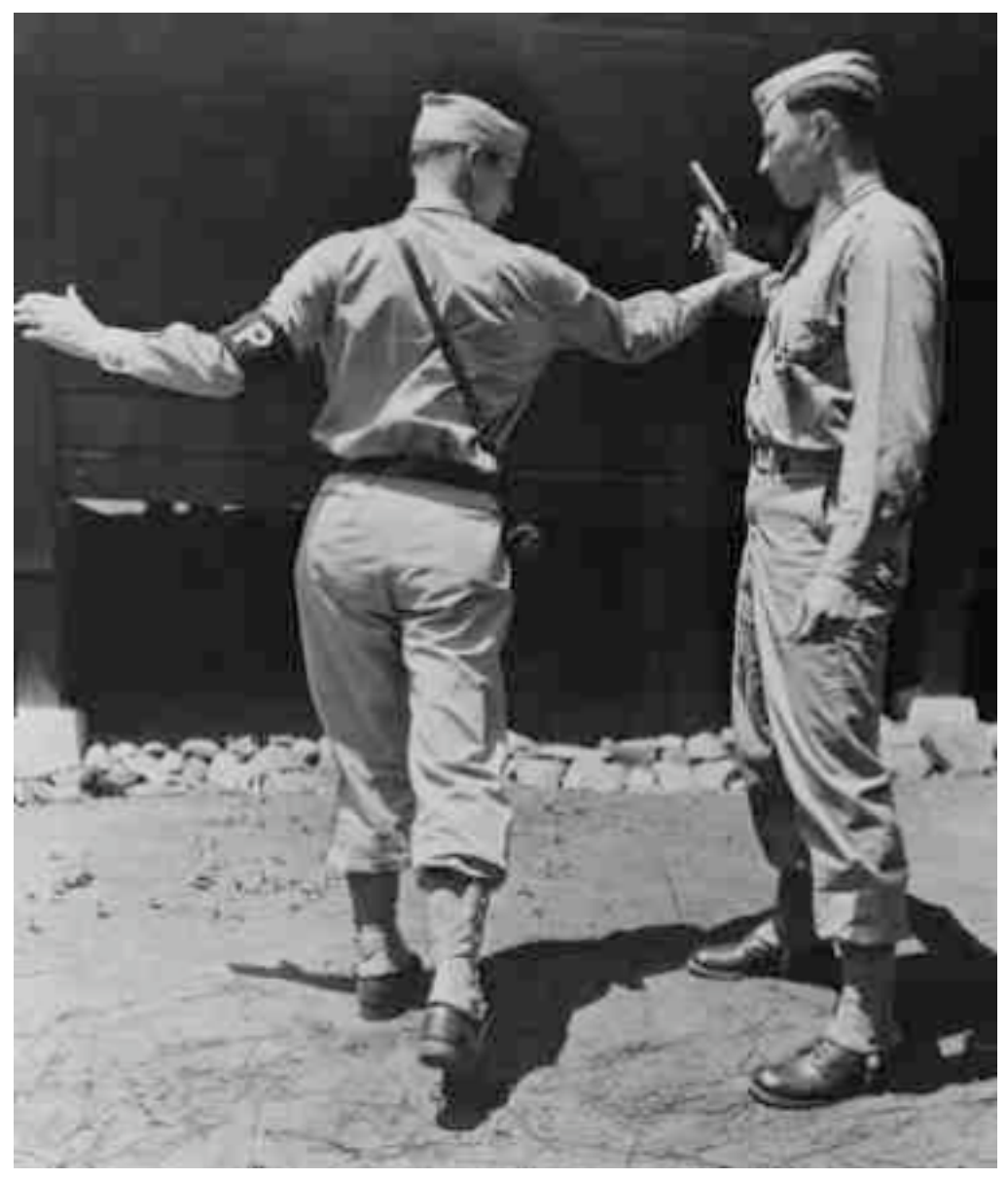
ABOVE PHOTO #1 SHOWING FIRST MOVE IN A HANDGUN THREAT COUNTERACTION. <u>THIS IS NOT BAD</u>. HOWEVER, PHOTO #2 — BELOW — SHOWING THE FOLLOWUP IS DANGEROUS AND FOOLISH FOR ANYONE TO ATTEMPT.

Second , to present an alternative approach (one that originated with our WWII military and our OSS) that works .