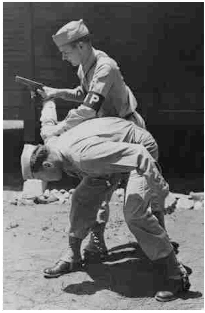
ABOVE PHOTO #2 SHOWING A FOLLOWUP THAT, ATTEMPTED AGAINST A HANDGUN THREAT IS <u>VERY</u> RISKY AND SHOULD NOT BE ATTEMPTED.

A handgun threat is LIFE-THREATENING. When and if you ever need to defend against such a threat it is ridiculous to attempt to gain arresting control over the weapon-bearer and try to end the encounter with an armlock!