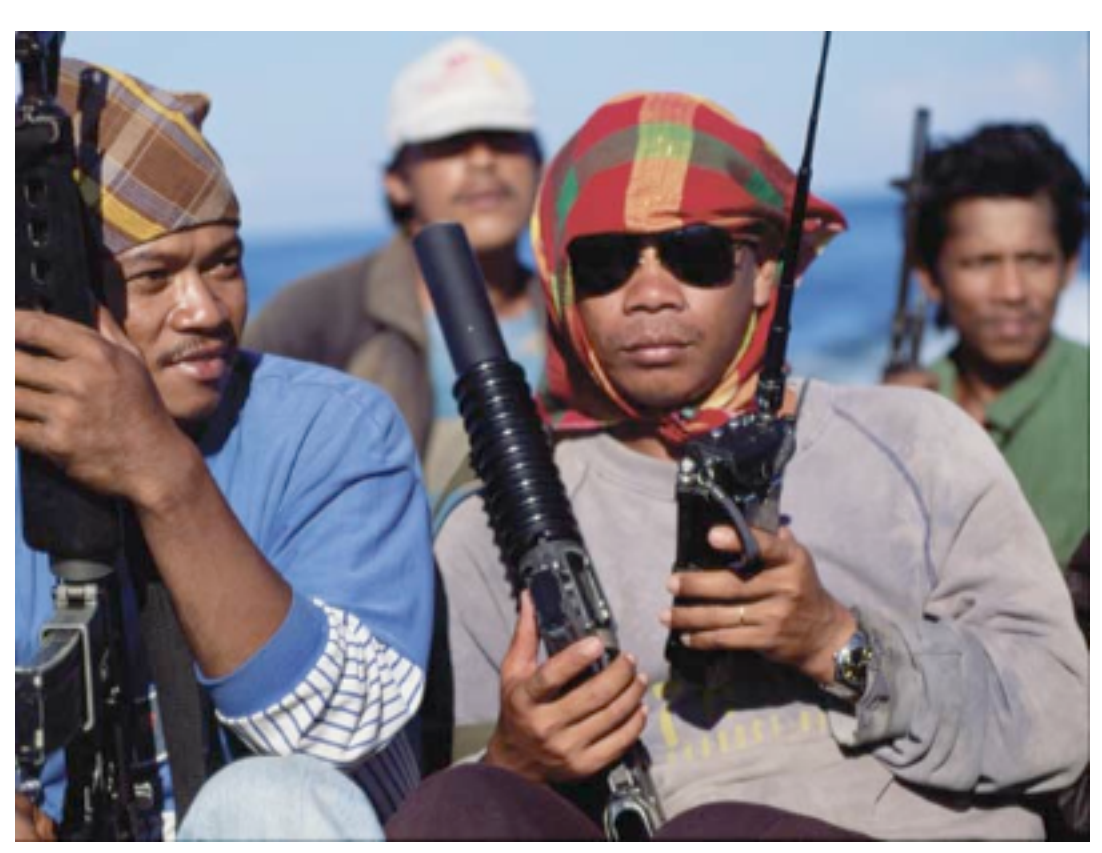
A band of pirates in the Philippines prepares for a raid in