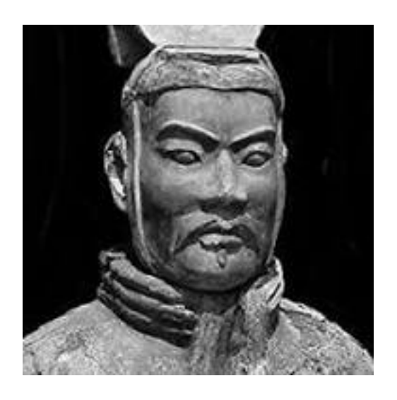
Know Your Enemy

"Know thy self, know thy enemy. A thousand Battles,